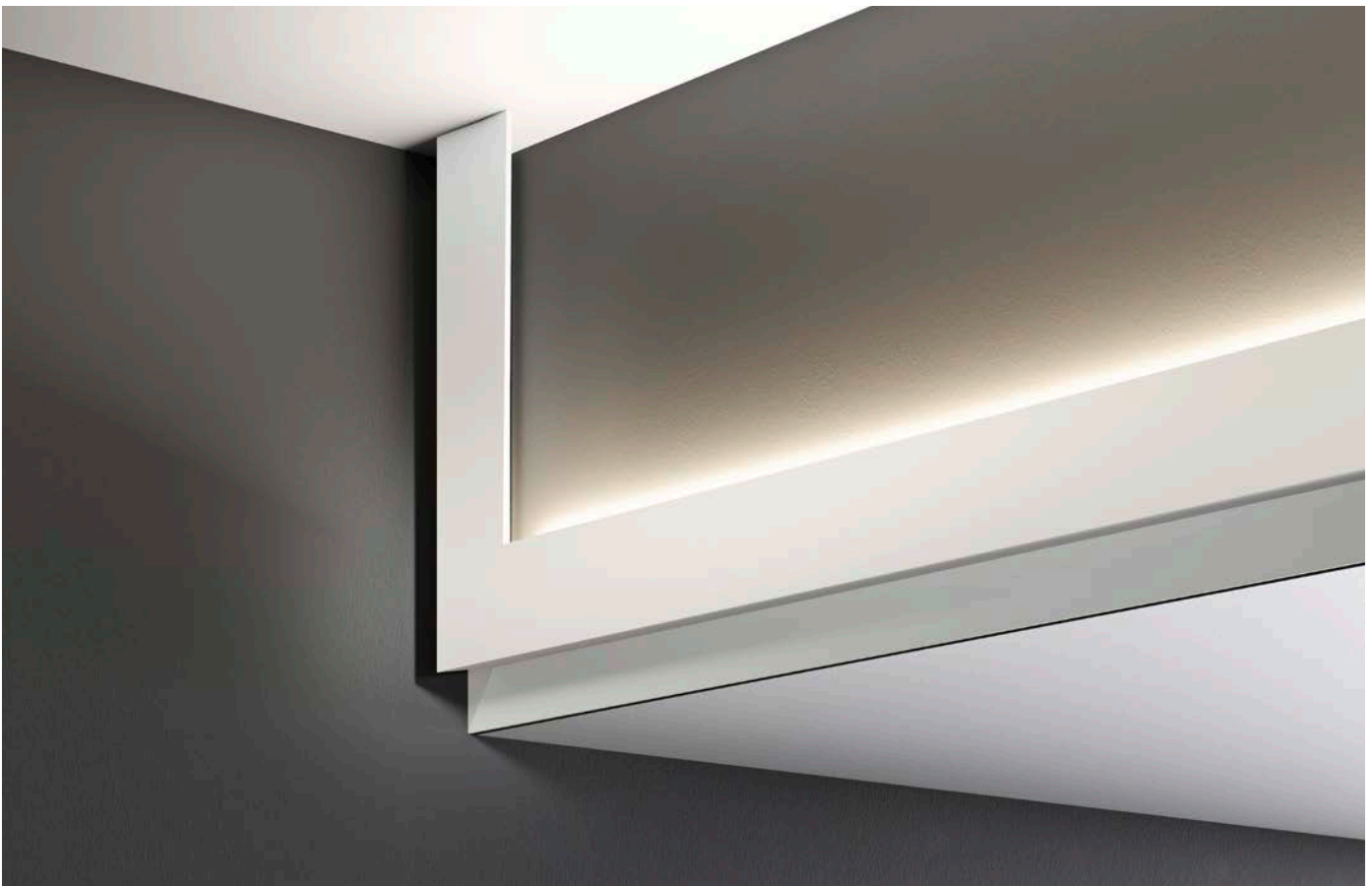
Photo: © NOËL & MARQUET by nmc / INTERIOR DESIGN PROJECT #michaelbihainstudio

The Red Dot Award: Product Design offers designers and manufacturers from all over the world a platform for assessing their products. In 2020, designers and companies from 60 countries entered more than 6,500 products in the competition. The international jury comprises experienced experts from different disciplines and has been convening for around 65 years in order to select the year’s best designs. The adjudication process lasts several days and is based on two essential criteria: The jurors test all of the entries in order to assess not just the aesthetic but also the materials selected, the level of craftsmanship, the surface structure, ergonomics and functionality. After intensive discussions, they make a decision on the design quality of the products. True to the motto “In search of good design and innovation”, only the best designs receive an award.