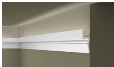
IL9 MEMORY ARSTYL®