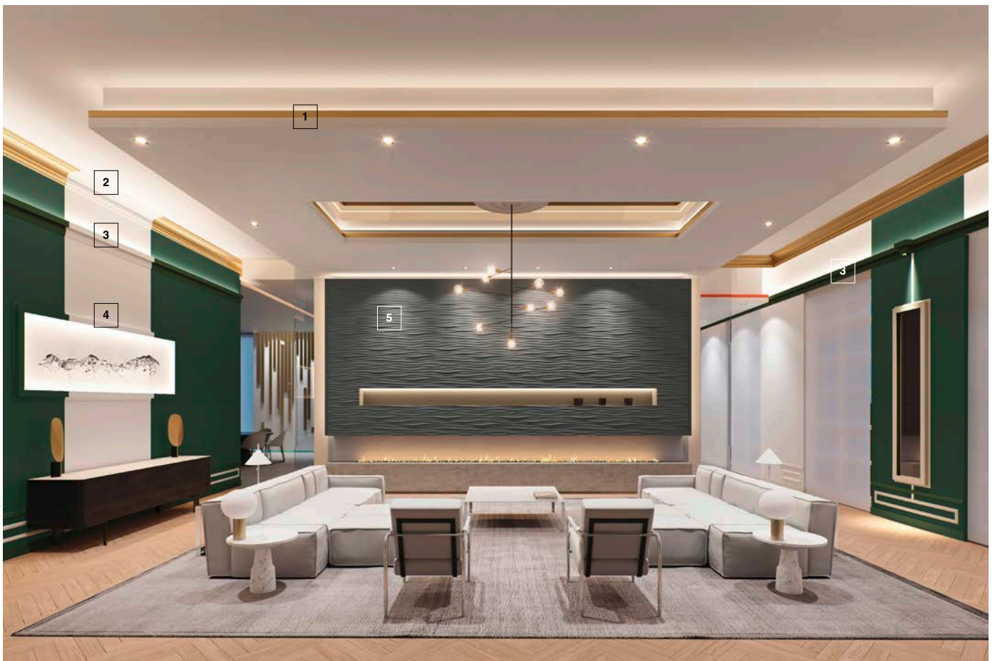
1 IL5 | 2 Z40 | 3 IL9 MEMORY | 4 IL6 | 5 LIQUID

Photo: © NOËL & MARQUET by nmc / INTERIOR DESIGN PROJECT #michaëlbhainstudio