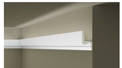
IL7 MEMORY ARSTYL®